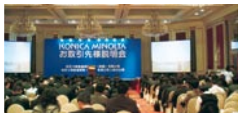
Meeting for suppliers